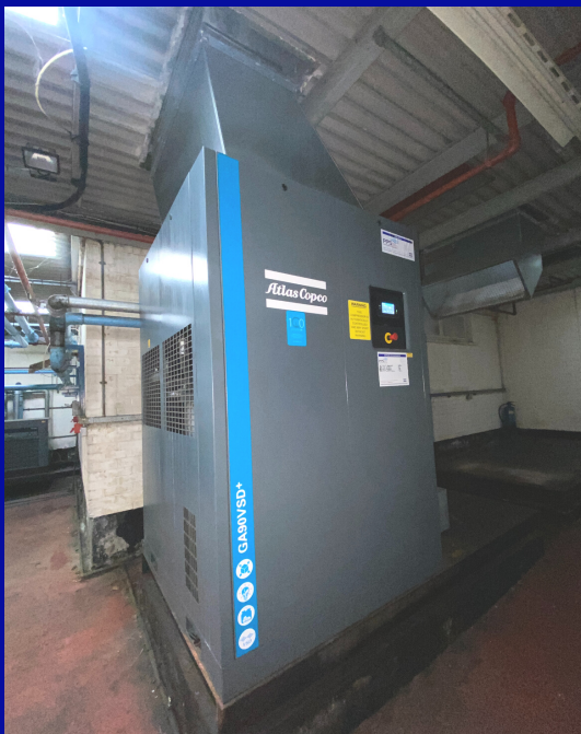
Newest, energy efficient unit