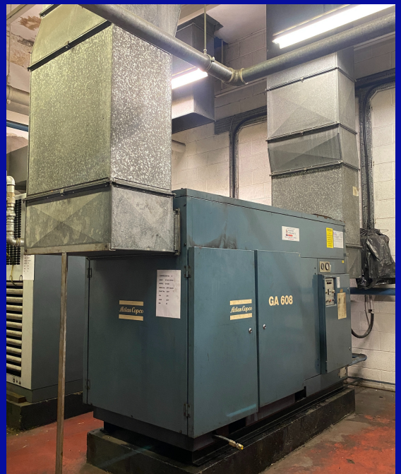
1977 unit, still fully operational